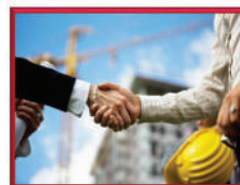
Trading & Contracting