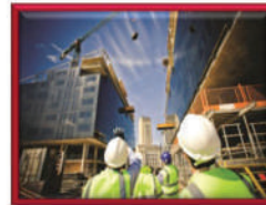
Cement, Engineering, Construction, Infrastructure