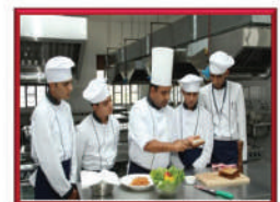
Hotel & Catering