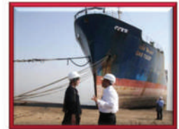
Marine, Ship Building & Repairing