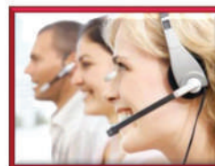
IT / BPO