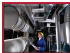
Oil & Gas, Power, Steel