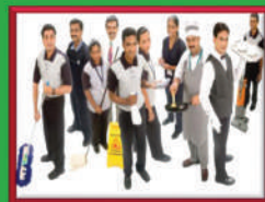
Hospitality & Facility Management